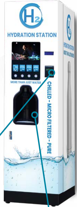
Standard water only graphics

Supports free-vend and most cashless payment systems.