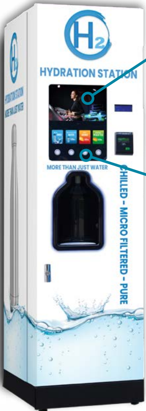
Standard juice graphics