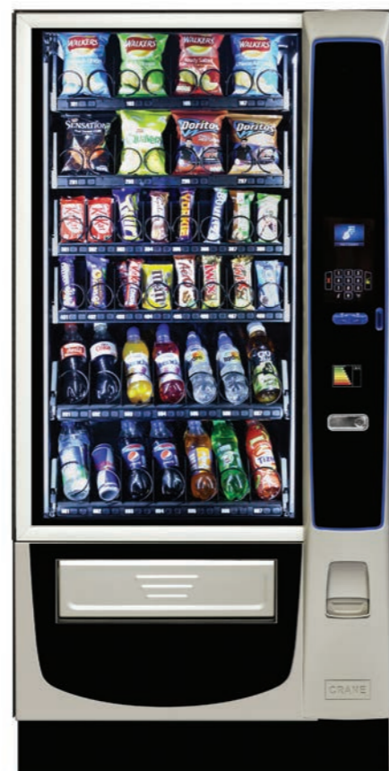
Merchant Media 4 with optional base graphic