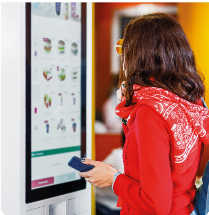
▼ Makes screens, doors and panels safer to touch