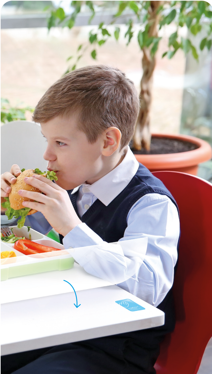
▲ Added protection for tables, desks and counters